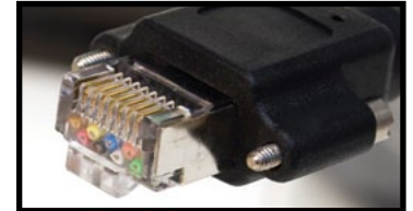
Camera-end screw lock connection