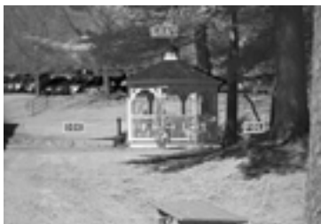
M18-SWIR imagery grayscale

Day/night imaging; sees through haze, obscurants Image magnification up to 4x Speeds proficiency for first time users, buttons for ambidexterous use Mark targets undetected Observe, detect, record and save target images to SD card Use as a handheld, tripod mount or remotely Two hours run time Ruggedized to military standards